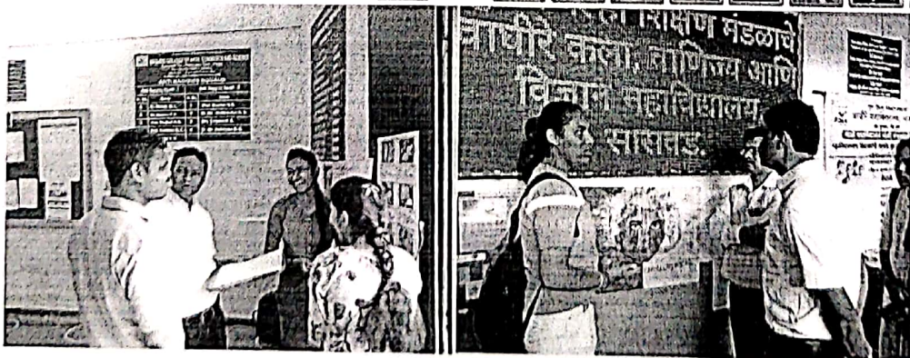
Poster Competition organised by department of Botany on 4 th Oct. 2022